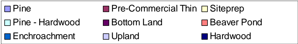
Acreage by Land Types